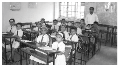
Students at school in Khardi

anniversary of the mission. Today ministers are still spreading the gospel to the lost. Do they pay a price? Absolutely! In recent visits with several of them, accounts were shared how their families rejected their presence once they received the good news of Jesus Christ.