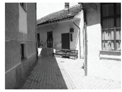
Auxiliary building needing renovation

Clothing distribution provides assistance to believers across Eastern Europe, with the greatest need being that of children's clothing and for elderly brethren. The latest sea container of clothing procured in the USA at discount prices and packed at Rittman was recently shipped. There was much joy among the brethren, young and old, as they worked together to restock the clothing distribution facility.