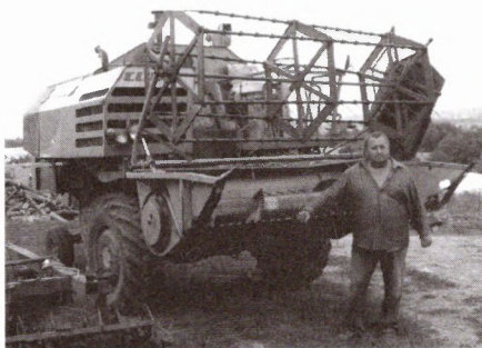
Bro. Tanasoi, a widower with a large family, from the Ostrita, Ukraine congregation, is responsible for this aging combine.

be used by multiple families. Funds donated specifically for this purpose by faithful brethren in the West have provided reliable Belarus 82hp front-wheel-assist tractors to most Ukraine congregations along with an assortment of basic implements. Specific brothers are assigned responsibility for scheduling, upkeep, and care of these machines. Ukrainian brethren cover the cost of fuel and expendable items such as oil, filters, and parts for minor breakdowns.