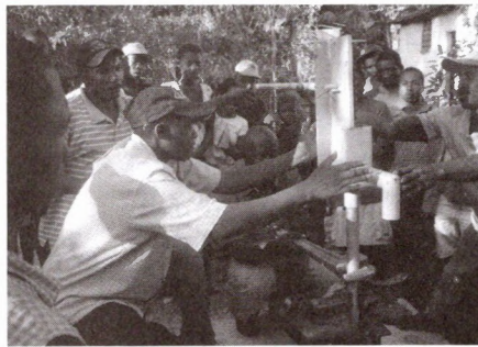
Initial installation of the pump on a new well

We have had the opportunity to receive work teams to put roofs on churches and schools. Also, several Indiana brothers are working with trade schools. They are dedicated to helping students learn a trade for life; such as masonry, carpentry, welding, sewing, cooking, and recently even computer classes. We regularly check up on these schools and are encouraged. We're privileged to work with the Haitian well-drilling team which many brethren from Tremont, Illinois are involved in.