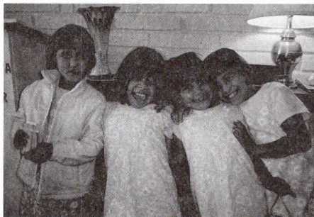
Children at Casa Vida y Esperanza

children, their families, neighbors, and others, but we feel that we are where God has sent us, and it is peaceful knowing that our Church has sent us here.