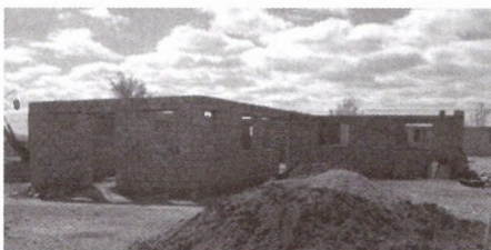
New Group Home

There is therefore opportunity for our brotherhood to organize a work team or to volunteer to go on a work team being organized by a team leader. There is also an ongoing need for funds directed to World Relief that can be utilized to help alleviate the suffering around the world including projects such as this one. We are grateful for the many brethren that give generously of time, talents, and resources to make such projects possible.