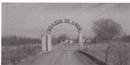
Entrance to Brazos de Amor

W e have worked through the Concern International organization to construct buildings to support the Brazos de Amor orphanage for needy children. The love for the children is very evident with the work going on at Brazos de Amor, located on the outskirts of Agua Prieta, Mexico. Brazos de Amor stands for Arms of Love.