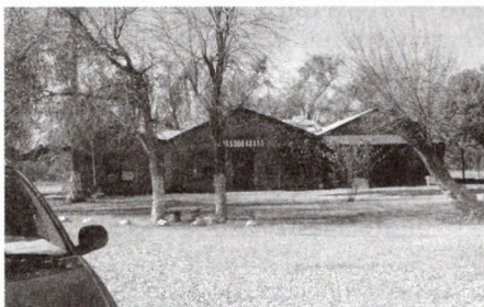
Main living quarters

and Tucson (2 hours) congregations. In contrast to the surrounding desert, there is a country atmosphere, palm trees, oak trees, green grass and lots of open space and possibilities. The existing buildings, which will be remodeled to accommodate 40 to 50