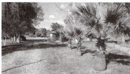
Entrance to the campus

This project is a joint effort of both the World Relief and Mission committees. World Relief will be involved in construction and the supply of funding, food, clothes and other necessities. There will be many opportunities for volunteers to participate in blessing needy children by giving time, talents or materials. The Mission Committee will support brethren sent to work and also would oversee the formation of a church as well if the decision is made to start one.