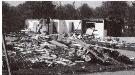
House in Fairfield before being torn down.

In every project, the recipients are appreciative of the efforts of the volunteers, who also receive the blessed peace of sharing with the unfortunate and those in need.