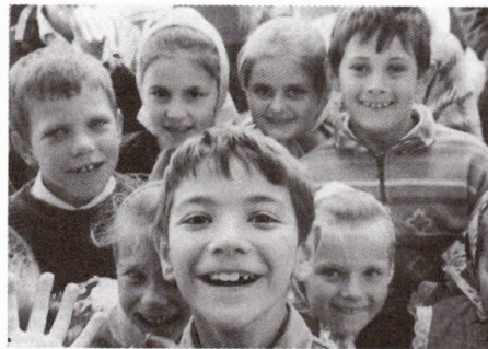
The children of Eastern Europe thank you for your help