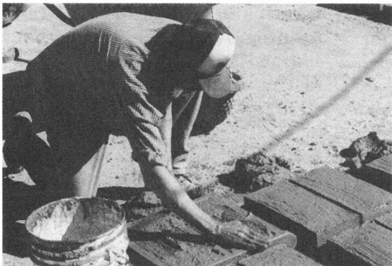
Making adobe blocks by hand

Future work teams to Agua Viva will be announced as soon as plans are finalized.