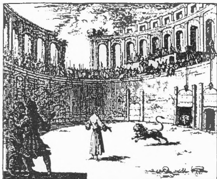
Ignatius Devoured by Wild Beasts

and more exercised and instructed; nevertheless, I am not justified thereby. O that I were already with the beasts, which are ready to devour me! I hope that, ere long, I shall find them such as I wish them to be, that is, cruel enough to destroy me speedily. But if they will not fall upon and tear me, I shall kindly allure them, so that they will not spare me, as they have already spared several Christians, but will quickly tear me in pieces, and devour me. Forgive me for speaking thus, I know what I need. Now only I begin to be a disciple of Christ. I regard neither things visible nor invisible, at which the world is amazed. It is sufficient for me if I but become a partaker of Christ. Let the devil and evil men afflict me with all manner of pain and torment, with fire, with cross, with fighting against wild beasts, with scattering of the members and bones of my body; all this I esteem very little, if I but enjoy Christ. Only pray for me, that inward and outward strength be given me, not only to speak or write this, but also to perform and endure it, so that I may not only be called a Christian, but also be found one in truth."