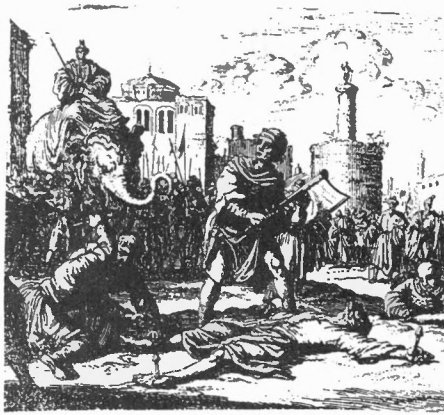
Matthew, Beheaded at Naddavar

Matthew was sent out to teach among the heathen of Ethiopia. However before leaving to teach in Ethiopia, he by the grace of God wrote the Gospel according to Matthew in the Hebrew language and