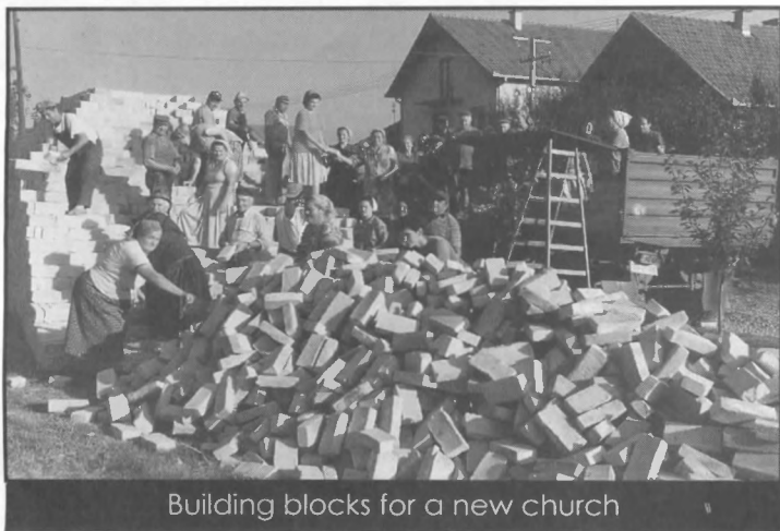
Building blocks for a new church

During the period from around 1875 until shortly before the Second World War, the number of believers in Yugoslavia was as high as 30,000. In spite of hardships and difficulties, the faith grew and flourished. Romanians, Hungarians, and Slovaks were a part of the overall membership, the majority of which is Serbian. At one time there were 260 churches with around 300 elders. However, it is to be noted that south of the Danube there was great persecution from State Church. 1,500 members once lived in this area, but were severely persecuted. Many of them were beheaded, and the Nazarene faith almost became extinct in this area.