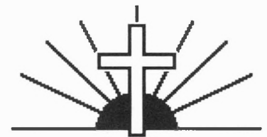
THE RESURRECTION OF JESUS

The Resurrection Proves Jesus Is The Son Of God