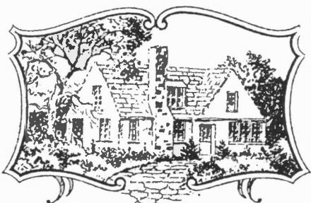
JUST LIKE MINE