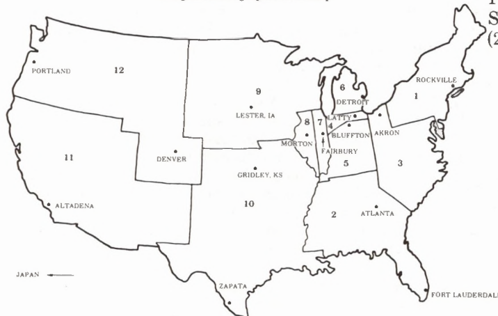
Designated Geographic Area Map