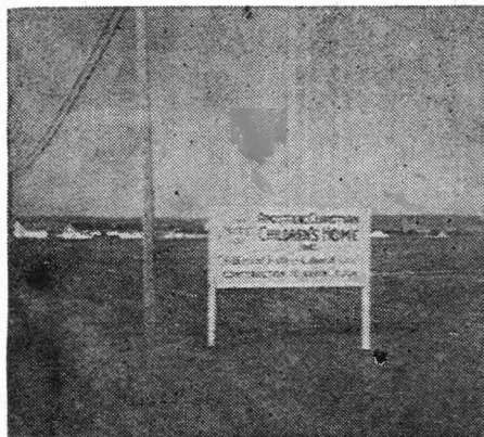
Sign along Grabill Rd.—the homes are some distance in from this.

The home-cooked meals served by the sisters from Latty, Junction, Bluffton, Remington, Francesville and Leo have helped much in the efforts to keep the work going.