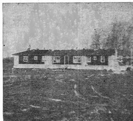
View of one of the homes.

We are very thankful to everyone for their continuing help, and for the contributions to pay for the materials. The next two or three months will see a major portion of the construction work completed.